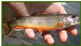
Brook Trout found in healthy sections of the stream