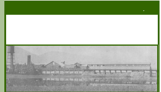
Former Brick Refractory in Beech Creek, PA