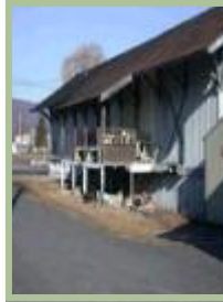
Historic Train Station—Beech Creek

The Brick Town Trail is the signature project of the Beech Creek Greenway Plan, an effort to leverage the recreational, historical, cultural, and environmental assets of the Beech Creek area in such a way that distinguishes this greenway plan from every other greenway plan in America. The resources the plan proposes to leverage are Bald Eagle State Park and its 1,700 acre Sayers Lake, 2 million acre Sproul State Forest, historic Curtin Village and reconstructed Eagle Ironworks, and the unique and fascinating stories in every brickyard town between them, all linked together by a network of trails and bike paths that not only serve the health and fitness needs of the local community, but entice and invite the weary urban dweller or the bored suburbanite to this wondrous place of refuge and renewal on the southern edge of the region known as the Pennsylvania Wilds.