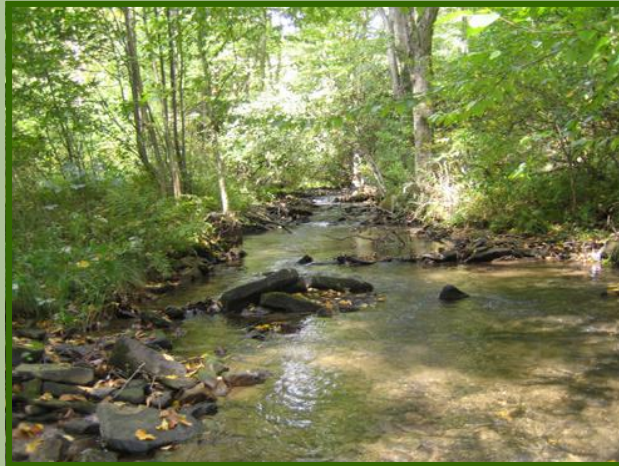
Tributary of Beech Creek

The Beech Creek Watershed can be restored to the "original quality of life" by undoing the harmful effects of factors such as acid mine drainage (AMD), chemicals, leachate and siltation. The entire Watershed can be "cleaned up" so that an informed, knowledgeable public can enjoy a multi-variable land use and activities while preserving, monitoring and protecting natural reproduction. This should include a sustainable, Class A, wild trout fishery, as well as habitat for a stronghold of wild birds, mammals, and diversified plant life.