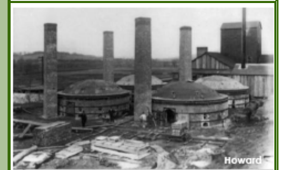
Former Brick Refractory in Howard, PA

An Initiative of The Beech Creek Watershed Association -and supported by- Centre County Planning & Community Development Office Clinton County Planning Office PA Department of Conservation and Natural Resources